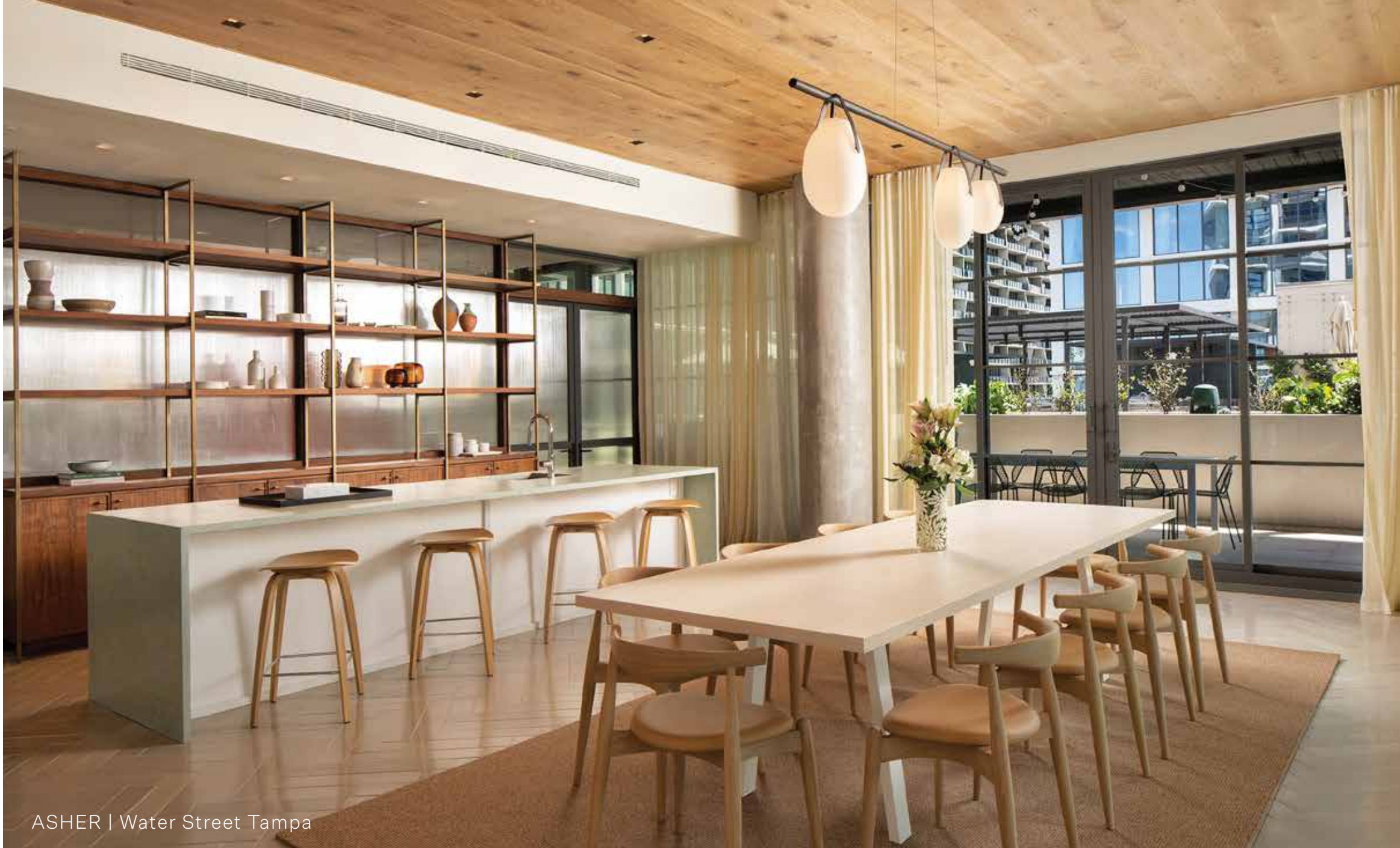
ASHER | Water Street Tampa