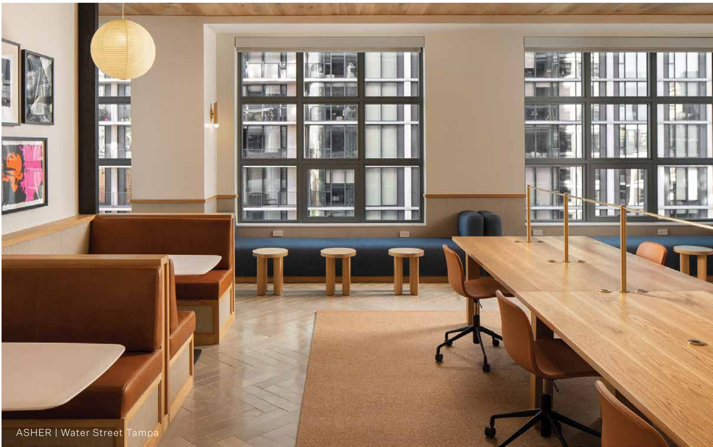
ASHER | Water Street Tampa