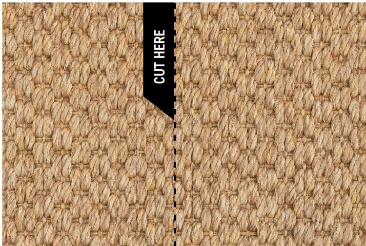
Figure 1: Cut 3rd row in from the center seam.